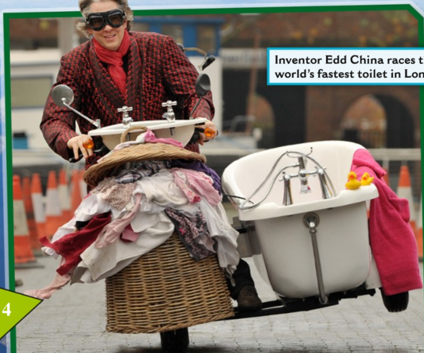
Inventor Edd China races the world's fastest toilet in London.

You will meet a lot of interesting people trying to be the best in their field. You'll meet people like Edd China. He is the brains behind the fastest toilet in the world. You'll also meet furry friends like Sweet Pea, a talented pup. Sweet Pea set the record for walking the fastest 100 meters (328 feet) while balancing a soda can.