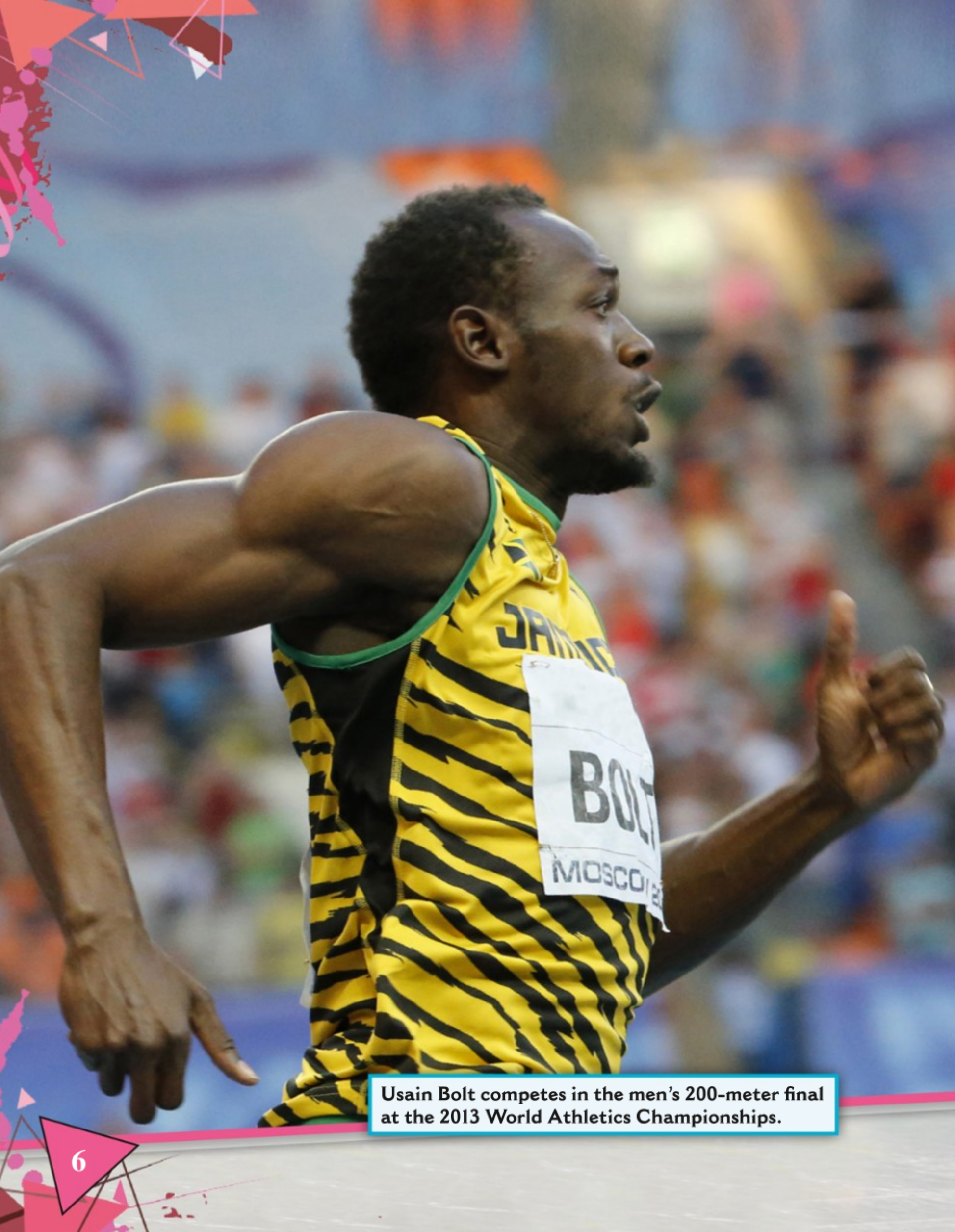
Usain Bolt competes in the men's 200-meter final at the 2013 World Athletics Championships.