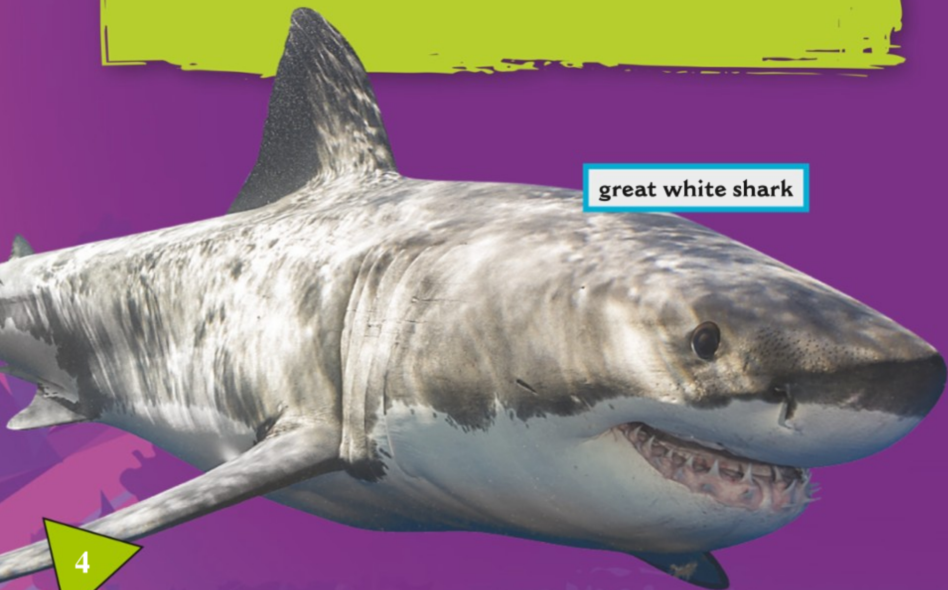
great white shark

There are over four hundred different species, or types, of sharks. Not all of them are dangerous. Most sharks do not bother people. When you get to know sharks, one thing is certain: all of them are unique .