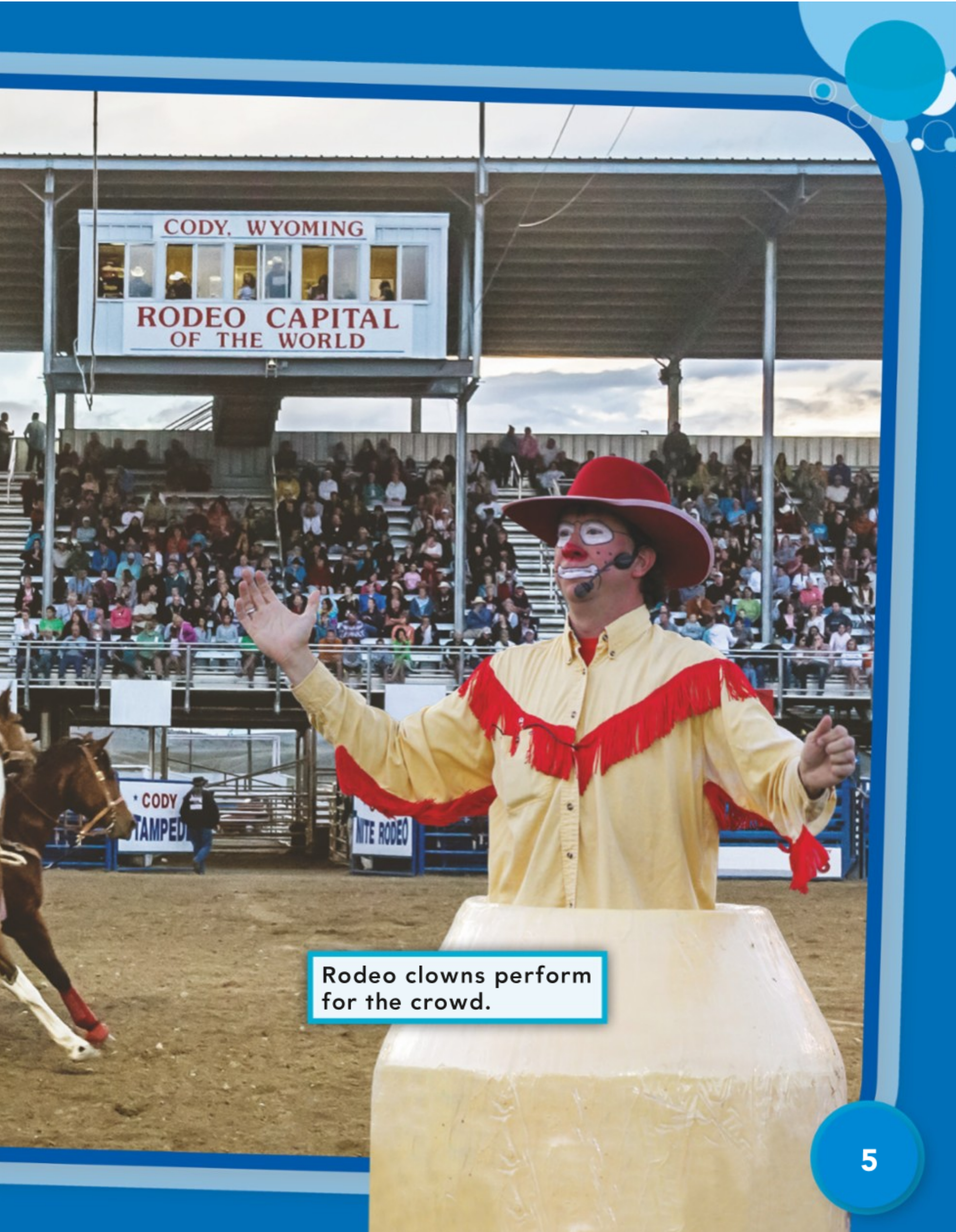
Rodeo clowns perform for the crowd.