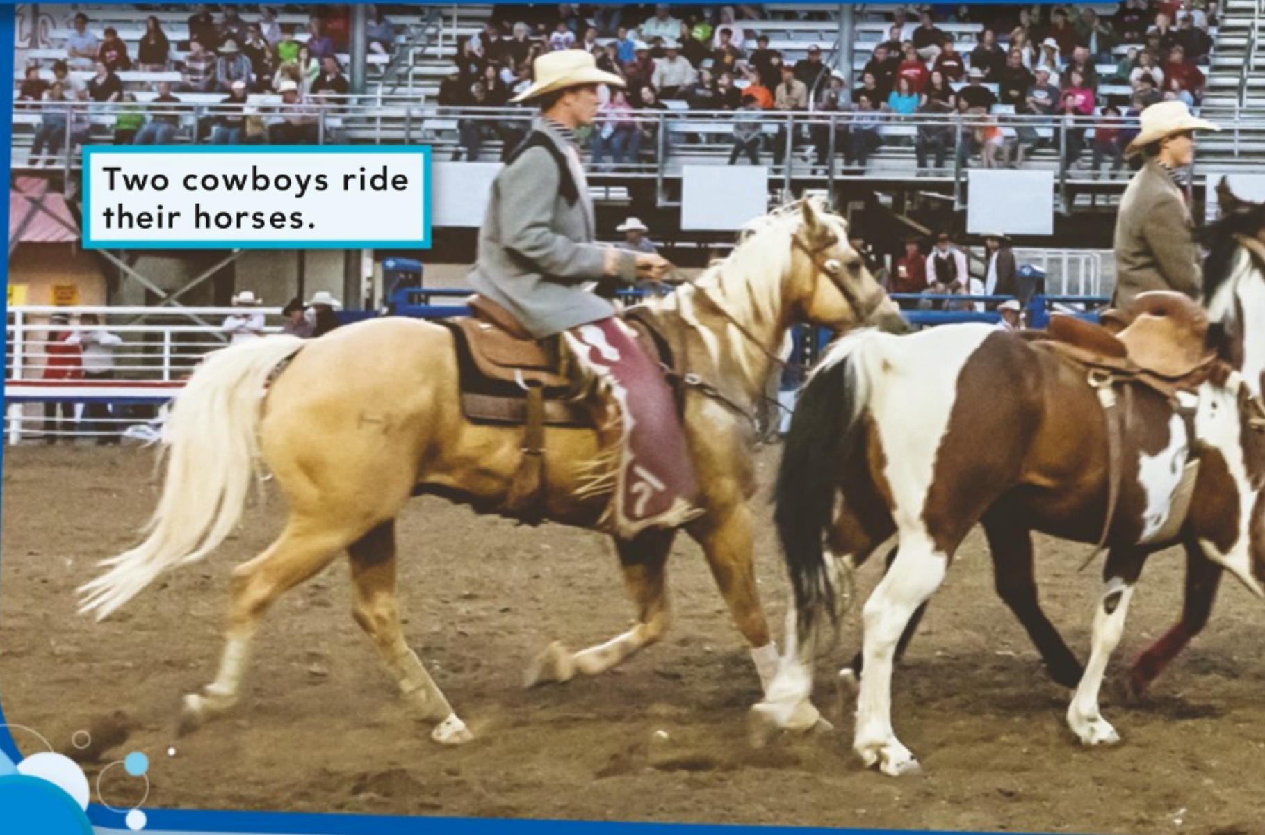
Two cowboys ride their horses.