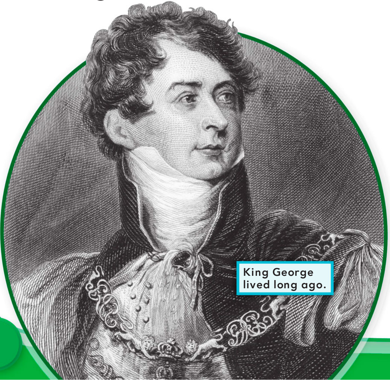
King George lived long ago.

The station was named after a statue called King's Cross. It was built in honor of King George.