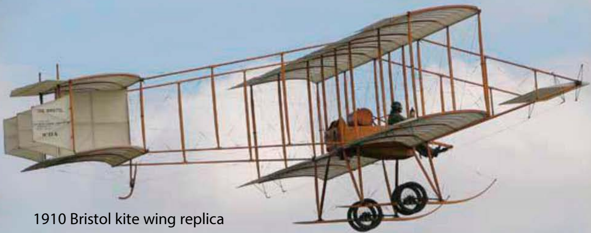
1910 Bristol kite wing replica

Airplane, airplane, up so high, Flying through the clear blue sky, Floating on the gentle breeze, Soaring, soaring, with such ease.