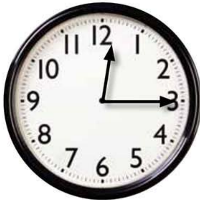
Time to Go Back to Class