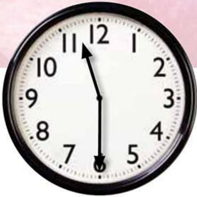
Time to Eat