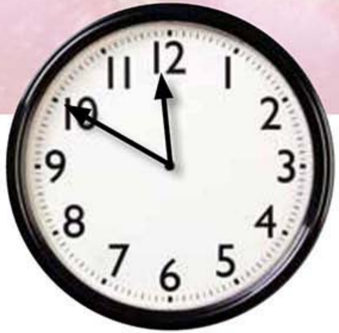
Time to Play