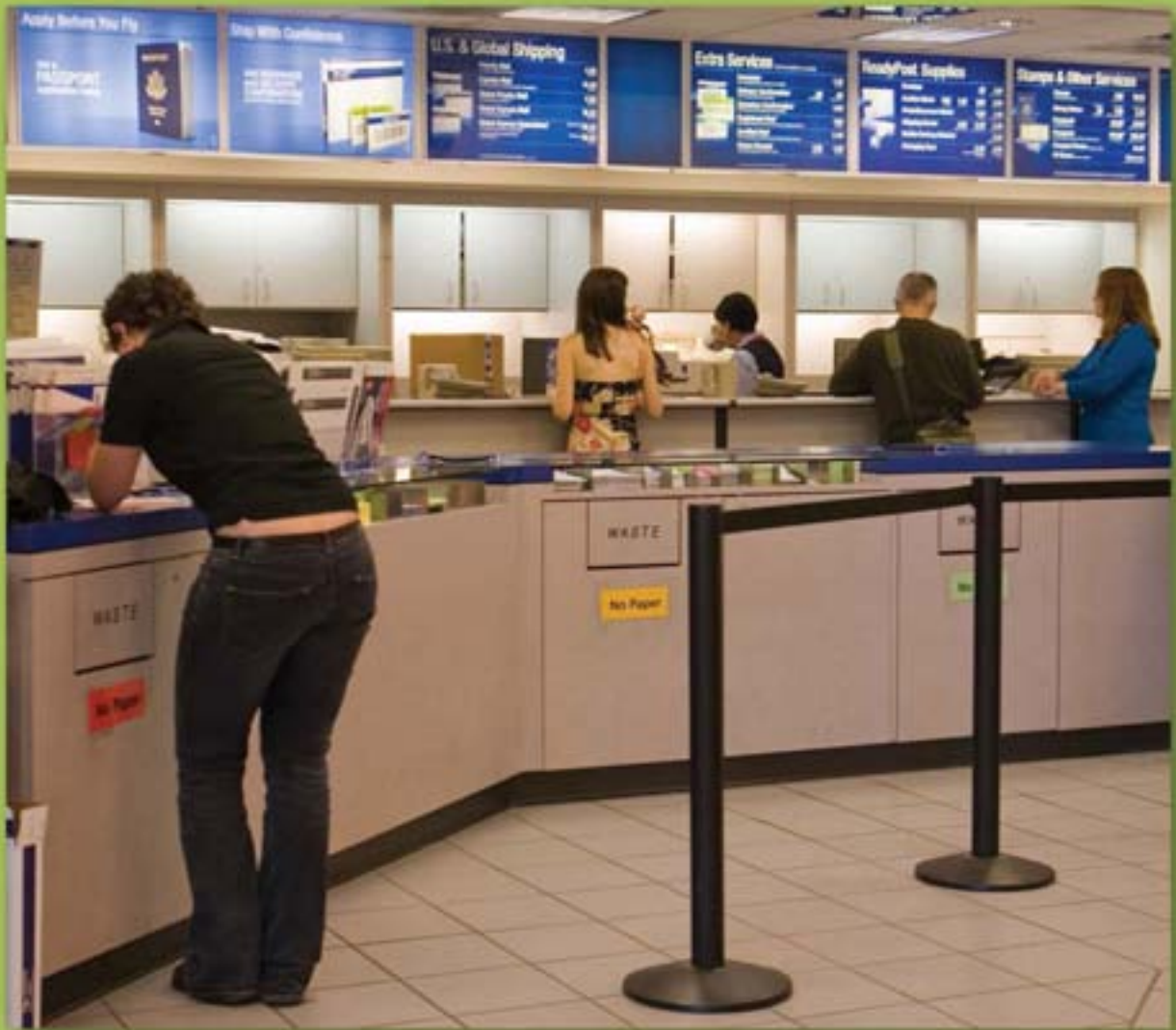
Post office workers help people every day.