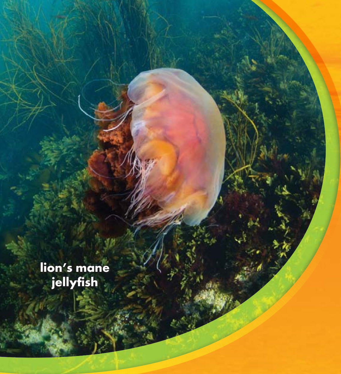
lion's mane jellyfish

Jellyfish are found all over the world's oceans. They drift through open waters.