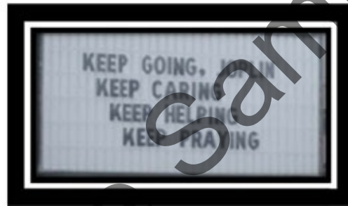
(Signs on local businesses showing their support)