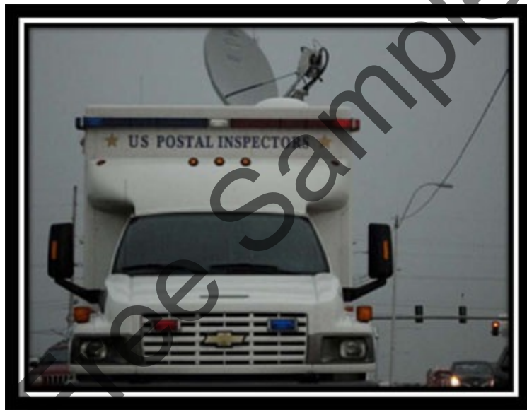
(US postal vehicle at south Joplin post office)

With hundreds of homes and businesses destroyed by the tornado, it has become almost impossible to get your mail. With one post office at the south end of town closed and the other post office at the north end of town handling all the mail there have been long lines. U.S Postal Inspectors have to be in the post office just to make sure everything is going OK. The average wait time just to get your mail was ranging from an hour to two hours or more in the weeks following the disaster. On some days, lines of people would be waiting out the door. PO Boxes sold out quickly with people not having mailboxes. If you were waiting for a check from FEMA, or to hear from a loved one, it was going to be several days before you got to find out anything. The other post office wouldn't be up and running for another month or longer. That put a lot of strain on individuals and families in this difficult time.