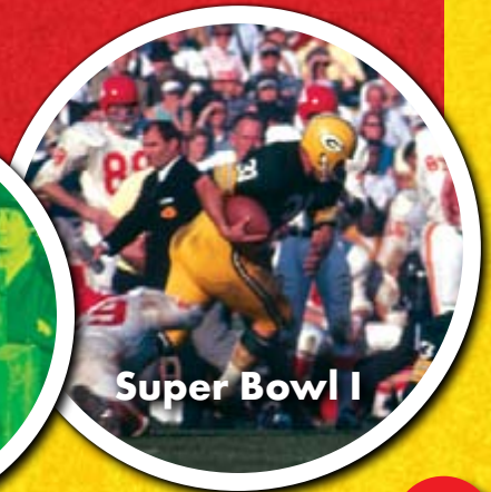
Super Bowl I