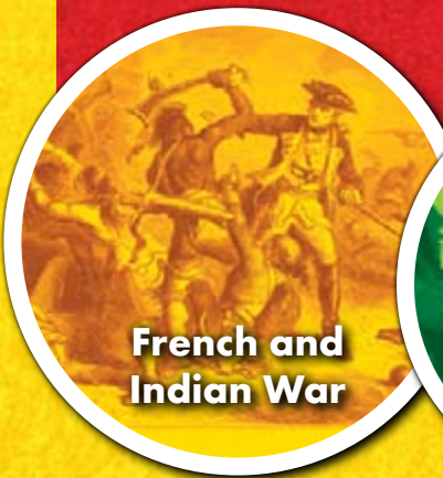
French and Indian War