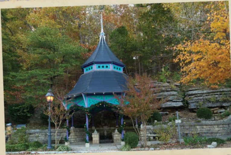
A little shelter covers Crescent Spring, decorating the natural landscape.