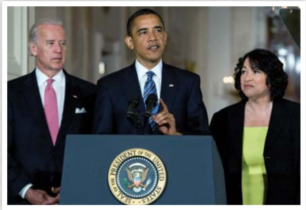
President Barack Obama, Vice President Joe Biden, and Supreme Court Justice Sonia Sotomayor at the White House.

On May 26, 2009, President Barack Obama announced that he had chosen Sonia Sotomayor to serve on the Supreme Court. Justices on the Supreme Court have the final say in what becomes law in the United States. Their decisions can and often do affect every American citizen.