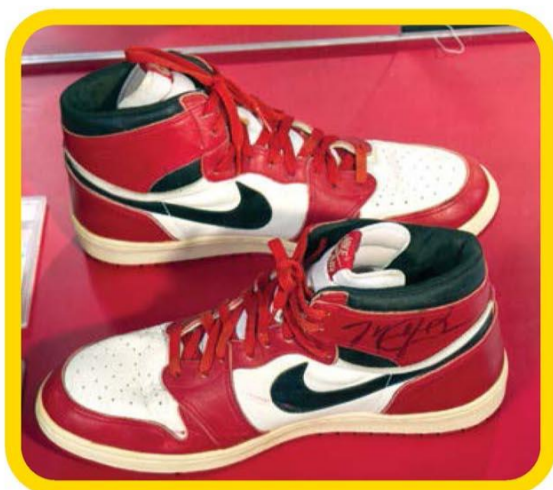
NBA basketball legend Michael Jordan wore this signed pair of Nike Air Jordan 1 in his rookie season.

When Jordan started playing in the NBA, Nike designed bright red and black basketball shoes for his size 13 feet. People called them “the devil’s shoes.” The NBA said they were illegal. They weren’t white like other basketball shoes. They fined him $5,000.00 every time he wore them in a game. Jordan wore the shoes anyway. They became a symbol of rebellion, power, and success. Kids wanted to wear them too. In 1985, Nike released a red and black sneaker called the Air Jordan 1. Its logo pictured Jordan jumping through the air with the ball. Fans bought 1 million pairs in a single month.