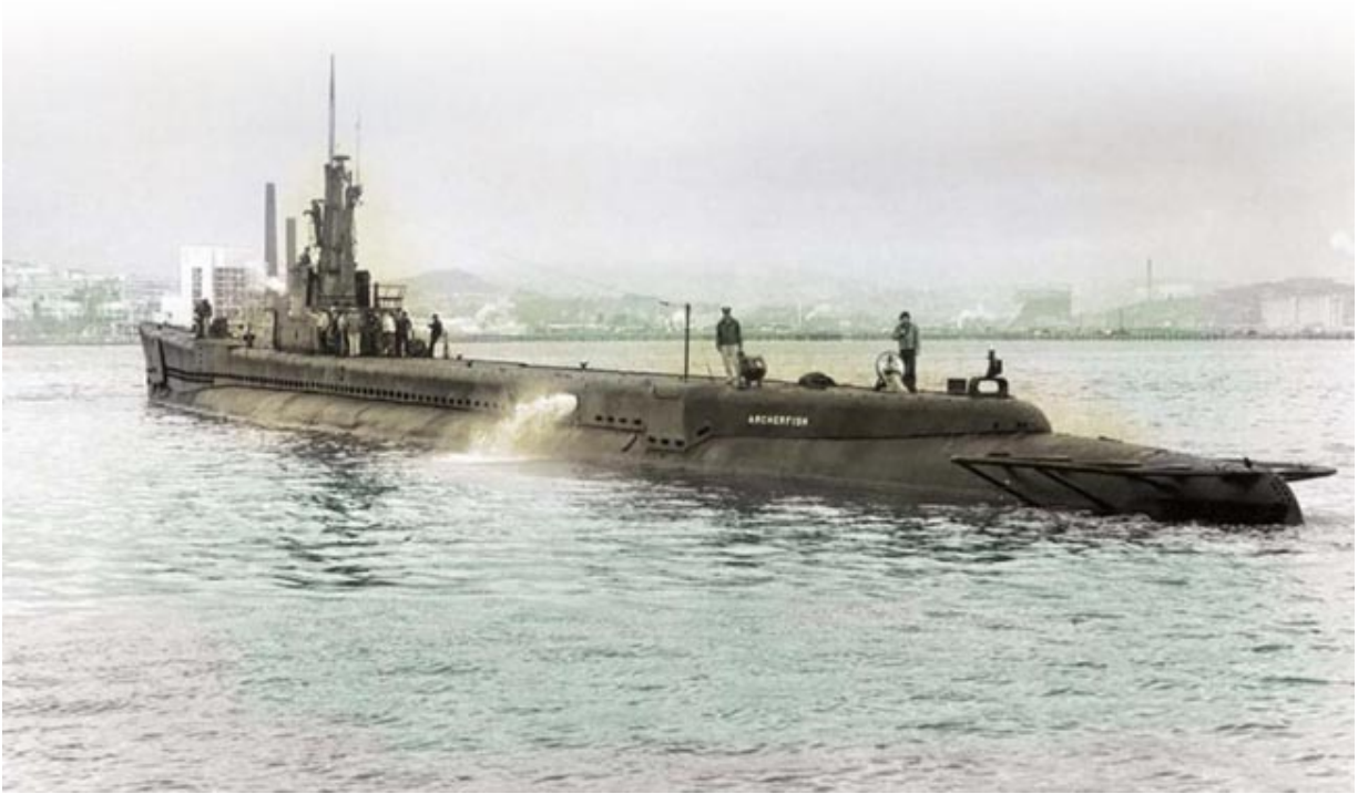
The Archerfish is shown around 1945.