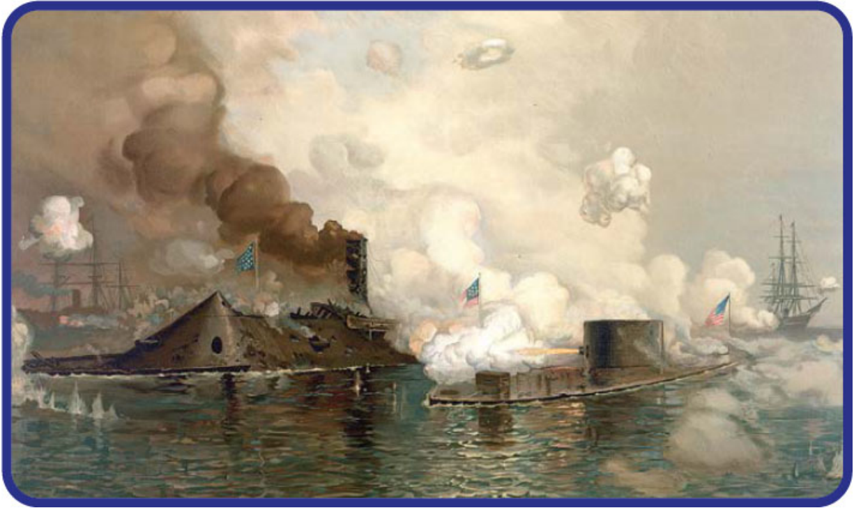
An artist's rendering of the battle between the Merrimac (left) and the Monitor .