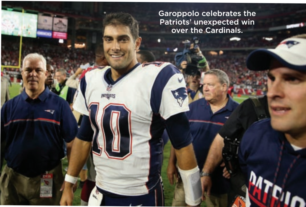
Garoppolo celebrates the Patriots' unexpected win over the Cardinals.

Garoppolo led the Patriots to a close 23-21 win against the Cardinals.