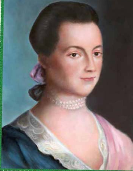
This is young Abigail.

Abigail's mother was caring. She helped needy families. Abigail's father was a pastor. He was in charge of a church. Back then, many schools only allowed boys to attend. So, Abigail's mother taught her and her sisters at home. Abigail loved to learn. She read many of her father's books.