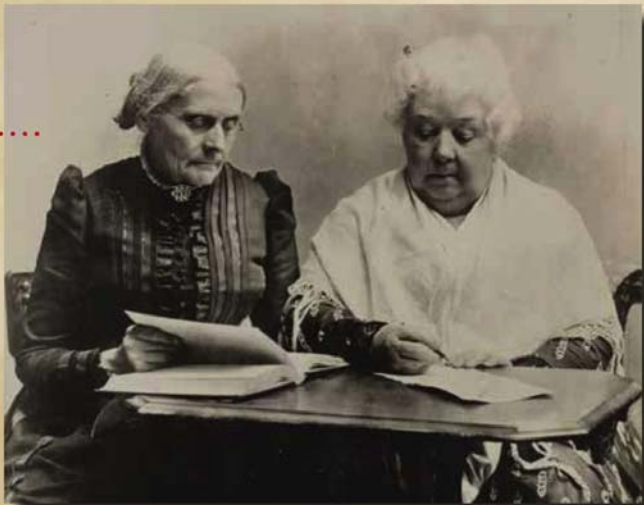
Susan B. Anthony (left) and Elizabeth Cady Stanton (right)

Elizabeth Cady Stanton and Susan B. Anthony were two leaders of the Suffrage Movement. They were called suffragists . Suffragists support the idea of giving the right to vote to other people, especially women. Cady Stanton and Anthony were close friends. They made a great team. Anthony organized everything. She ran things well. Cady Stanton liked to write and give speeches.