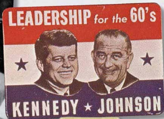
campaign button, 1960