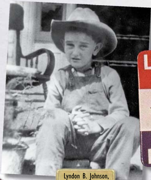
Lyndon B. Johnson, 1915

In politics, the public called Johnson by his initials, LBJ. Like most Texans at the time, Johnson was a Democrat . He represented Texas in the U.S. Congress from 1937 to 1961. For the first 12 years, he was a representative . For the next 12 years, he was a senator .