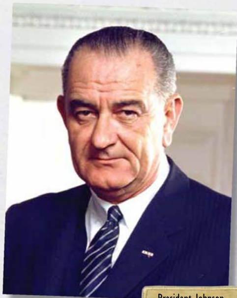
President Johnson, 1964

In 1961, Johnson became vice president under President John F. Kennedy. But in 1963, Kennedy was shot and killed. That day, Johnson was sworn in as the 36th president of the United States. Johnson was a strong leader and a gifted speaker. He dedicated his life to helping others and his country.