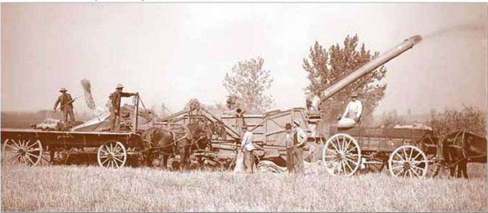
◆ An early farming machine