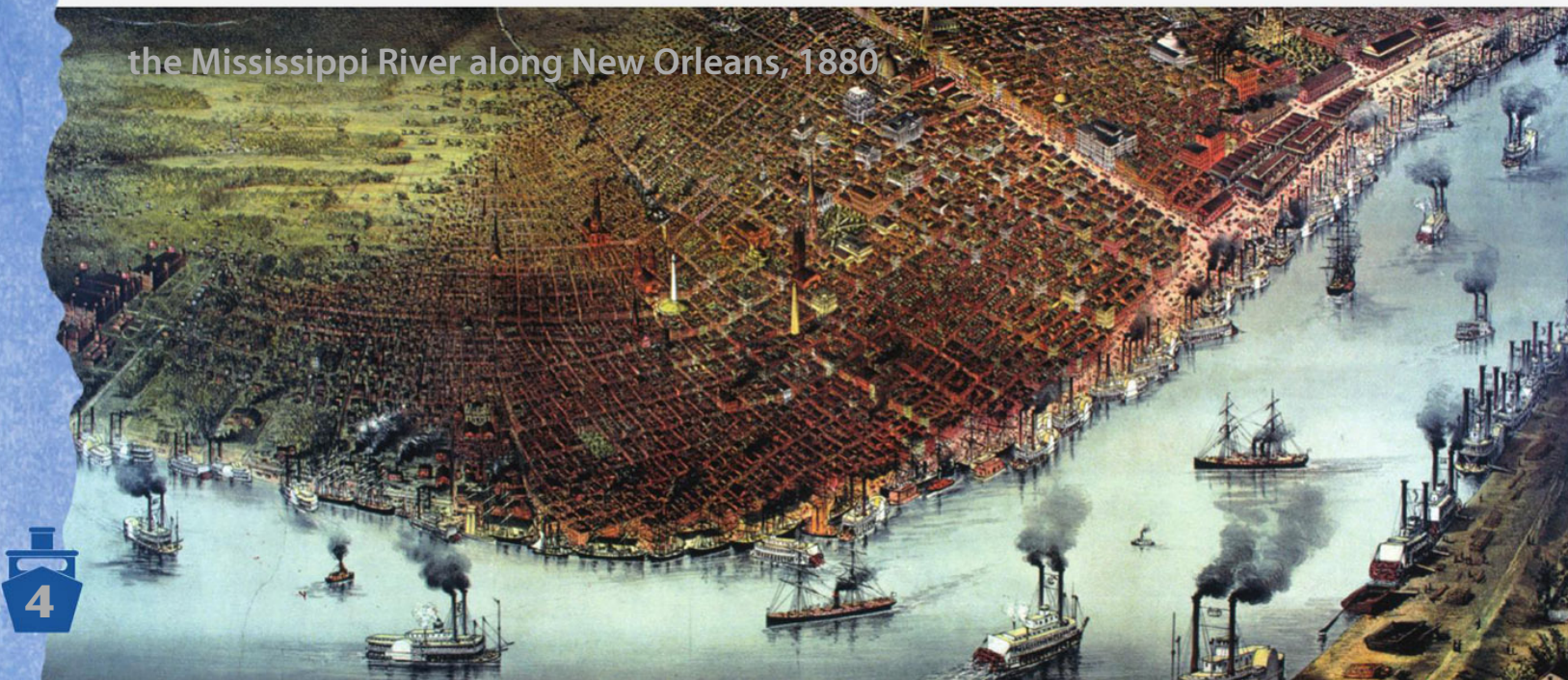
the Mississippi River along New Orleans, 1880

The history of the Mississippi River is the history of the United States. People have prospered along its riverbanks. Cities have grown there. The river is part of the borders of ten states. It provides food, water, and transportation today. And its story began long, long ago.