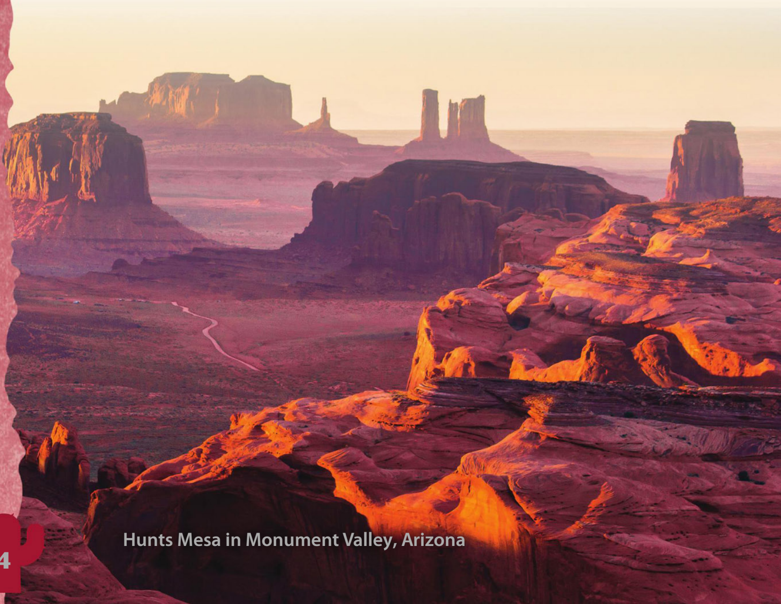
Hunts Mesa in Monument Valley, Arizona

The Southwest includes Arizona, New Mexico, Texas, and Oklahoma. These states were some of the last admitted into the United States. Today, much of the land of the Southwest belongs to American Indian tribes. Many people work hard to maintain the rich history and cultures of the native peoples.