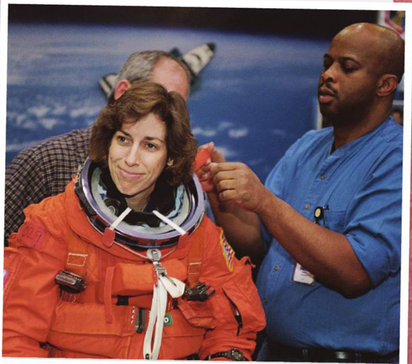
Astronaut Ellen Ochoa prepares for training at the Johnson Space Center.

The Southwest also looks toward the future. It is home to the Johnson Space Center. The center is located in Houston, Texas. It is where NASA astronauts train to fly into outer space. It has been the mission control for NASA space flights since the 1960s.