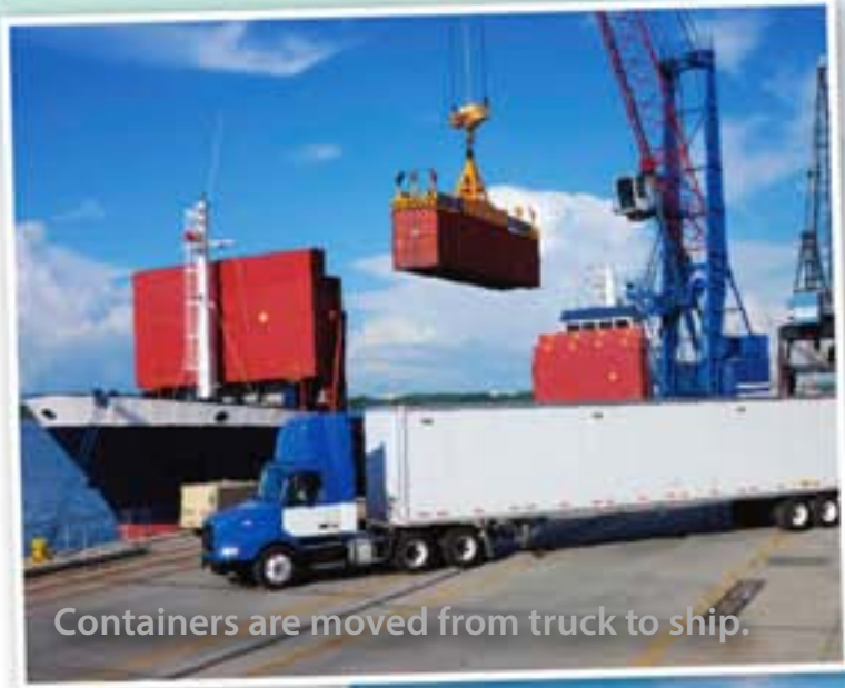
Containers are moved from truck to ship.