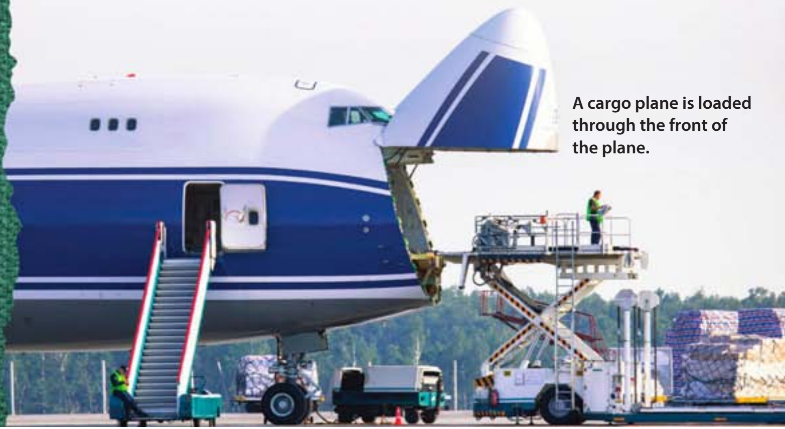
A cargo plane is loaded through the front of the plane.

Trucks are usually the last piece in the shipping puzzle. They are used to move goods that arrive at shipping ports or airports. And they carry packages that get delivered directly to a person's mailbox or front door.