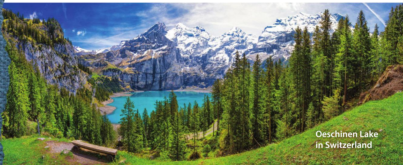
Oeschinen Lake in Switzerland