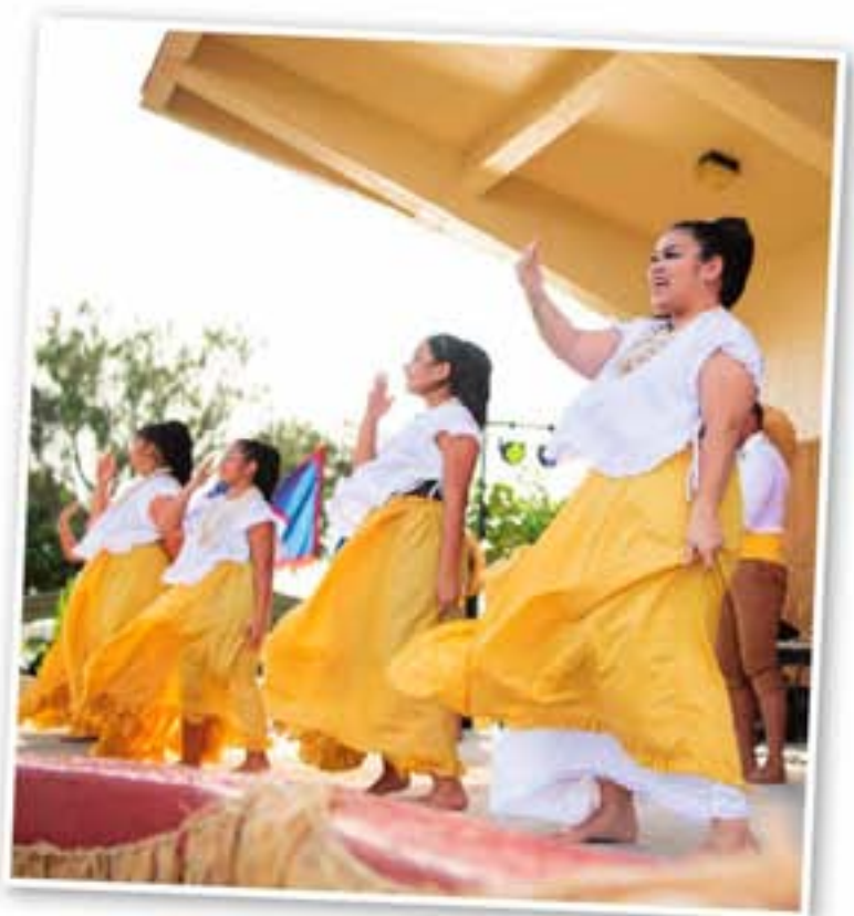
CHamoru dancers perform in Guam.

Guam is a territory of the United States. It has a mix of cultures. People in Guam celebrate U.S. holidays. Guam also has influences from Spain and the native CHamoru people. The CHamoru are a respected group of people. It is common to see their traditional dances and hear their music in Guam.