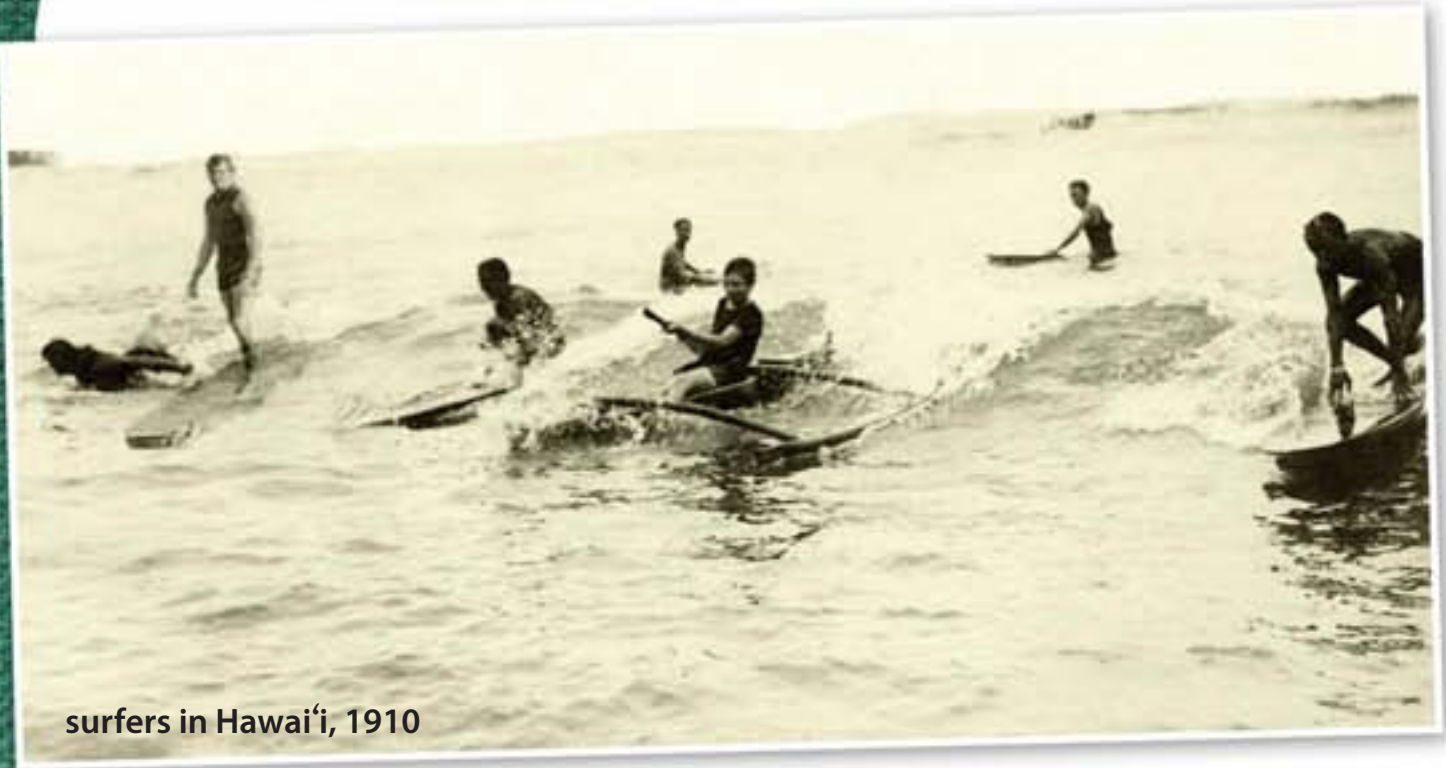
surfers in Hawai'i, 1910