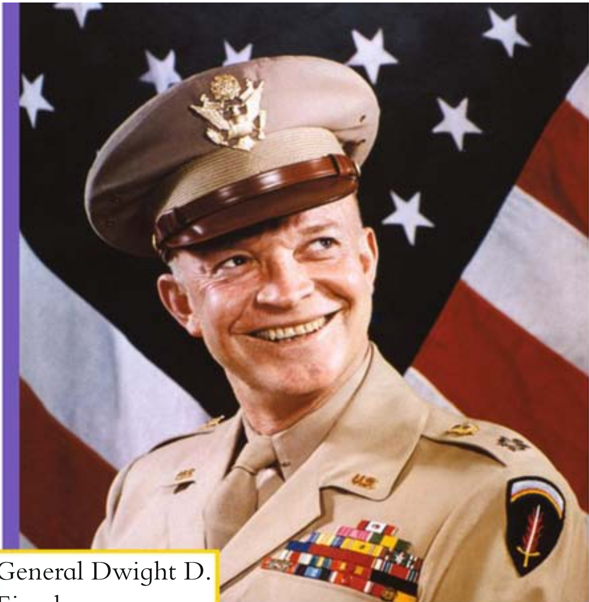
General Dwight D. Eisenhower

Dwight D. Eisenhower was a famous leader. He knew how to take charge. People looked up to him. He led the U.S. Army. He also led the country. He was president from 1953 to 1961. His leadership skills helped the country. Many people think of him as a great leader. But how did he become such a strong leader?