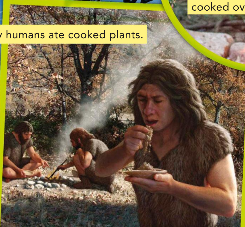
Early humans ate cooked plants.