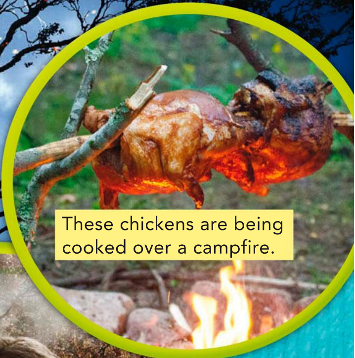
These chickens are being cooked over a campfire.